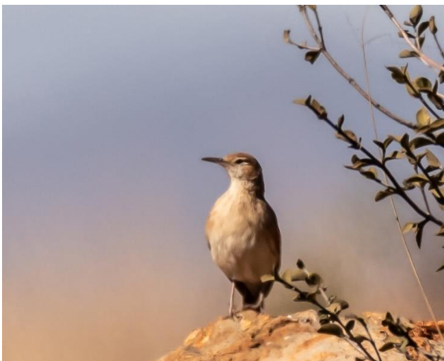
Eastern Long-billed Lark [Angela Openshaw]