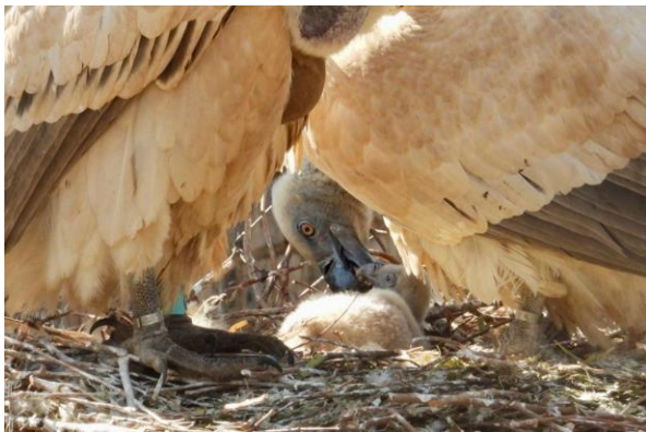
Cape Vulture tending its chick, part of VulPro's breeding programme, for eventual release in the wild. [Wouter Fourie]