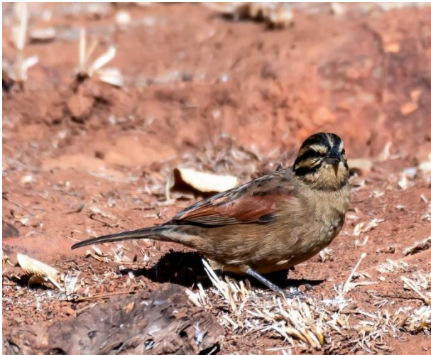
Cape Bunting [Angela Openshaw]