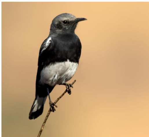
Mountain Wheatear [Mauritz Kotze]