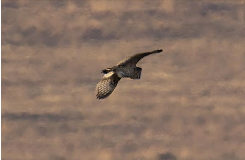
Bird of the Day – African Grass Owl [Sean Naudé]