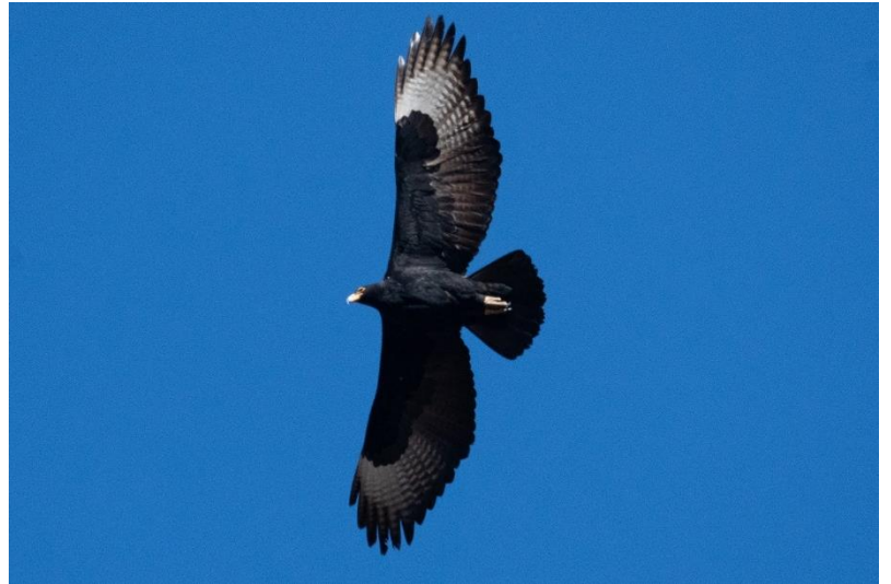
Verreaux's Eagle [Willie Victor]