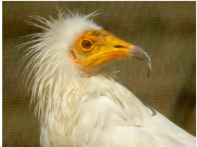
The undeniable star of the show was this Egyptian Vulture. [Wouter Fourie]