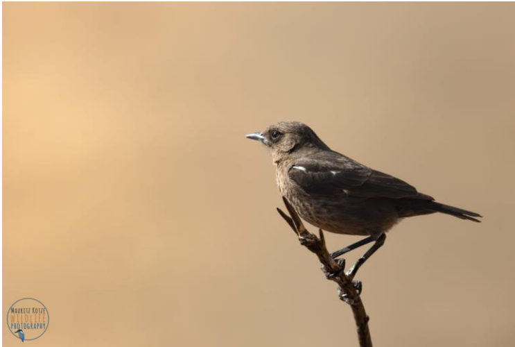
Ant-eating Chat

No-one should ever say winter birding in Gauteng is boring. Similar to Devon grasslands and Suikerbosrand, Boon's road always delivers interesting species during winter months. Keanu Canto guided the group. Highlights were White-bellied Bustard, Quailfinch, Lanner Falcon and Chestnut-backed Sparrow-Larks.