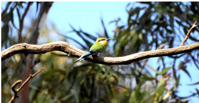
Swallow-tailed Bee-eater