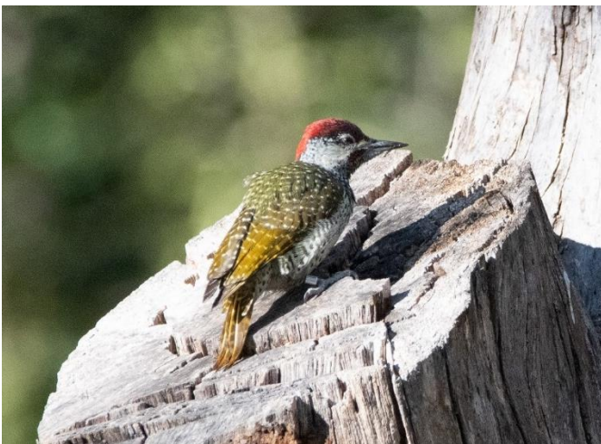
Golden-tailed Woodpecker [Willie Victor]