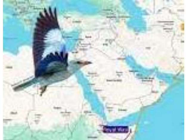
Hera, the European Roller [BLSA]