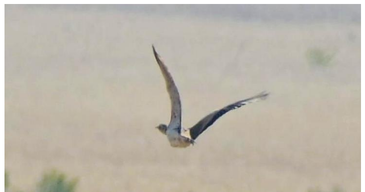
White-bellied Bustard [Pieter Uytenweerde]