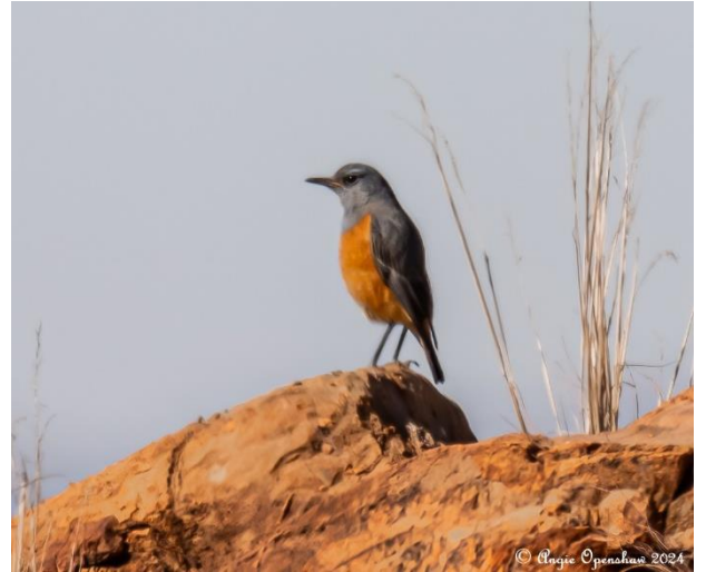
Sentinel Rock Thrush [Angela Openshaw]