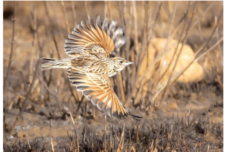
Rufous-naped Lark [Sean Naudé]