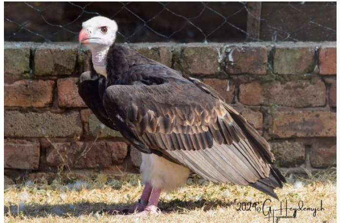
A special treat to see one of these at close quarters: a White-headed Vulture [Gerdu Heydenrych]