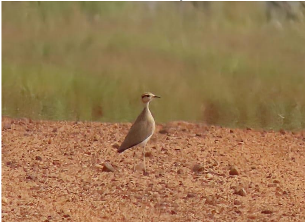
Temminck's Courser [Ivonne Coetzee]