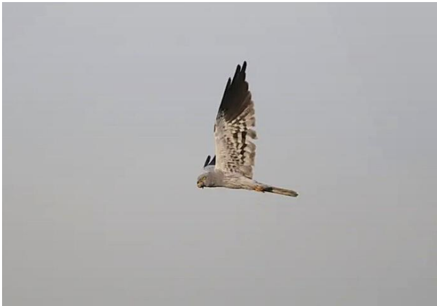
Montagu's Harrier