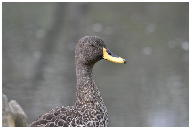
Yellow-billed Duck [Sheleph Burger]