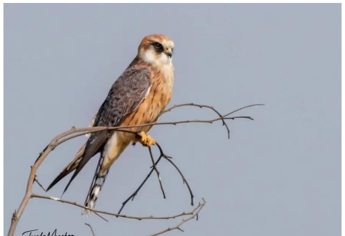
Red-footed Falcon [Trenly Meacham]

Dinokeng delivered some good birds with Lesser Moorhen (Akil Ramcharan), Bronze-winged Courser and Eurasian Hobby (Anthony Paton). A Blue Crane was seen flying over a farm by Daniël du Preez.