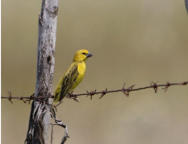
Cuckoo-finch [Adelle van Zyl]