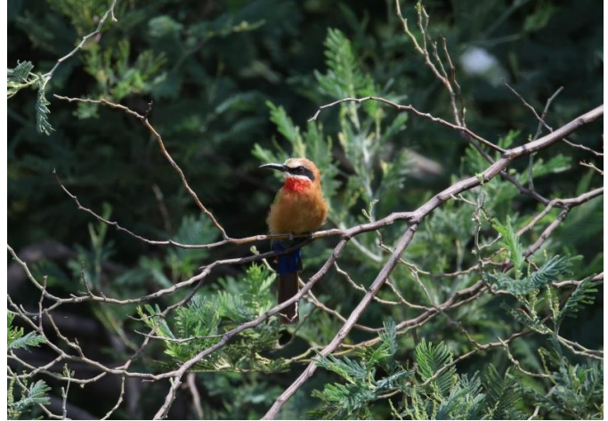
White-fronted Bee-eater [Johan Kampman]