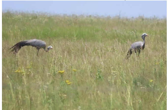
Blue Cranes [Ivonne Coetzee]