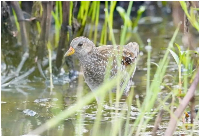
Spotted Crake [Martin Brits]

Marievale also offered a feast of rarities: Spotted Crake , Baillon's Crake , Bronze-winged Courser , Western Marsh Harrier and a Lesser Moorhen .