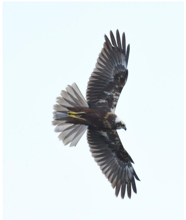
Western Marsh Harrier