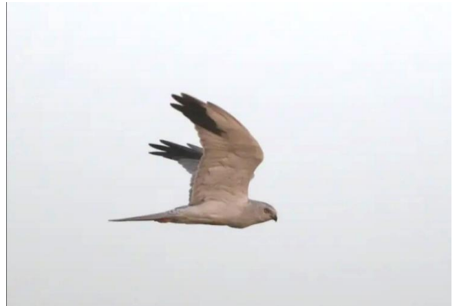
Pallid Harrier [Ludwig Roell]

Marievale also offered a feast of rarities: Spotted Crake , Baillon's Crake , Bronze-winged Courser , Western Marsh Harrier and a Lesser Moorhen .