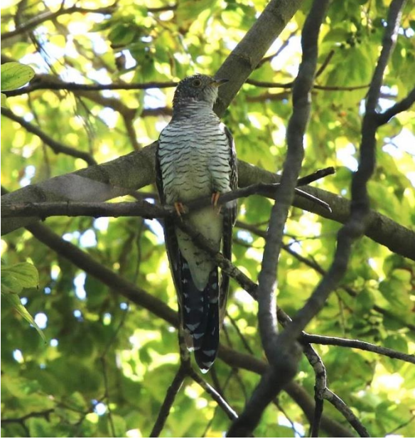
Common Cuckoo [Bruce Long]

One report of a Buff-spotted Flufftail heard calling and a Common Cuckoo at WSBG were posted on social media. The latter could be the same individual that was seen there in January 2025.