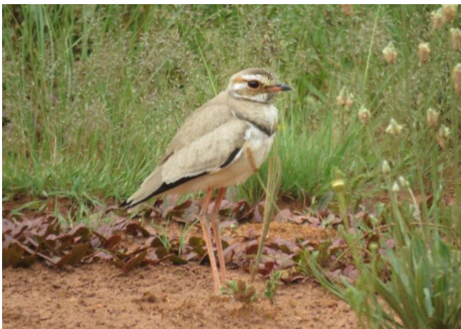
Bronze-winged Courser