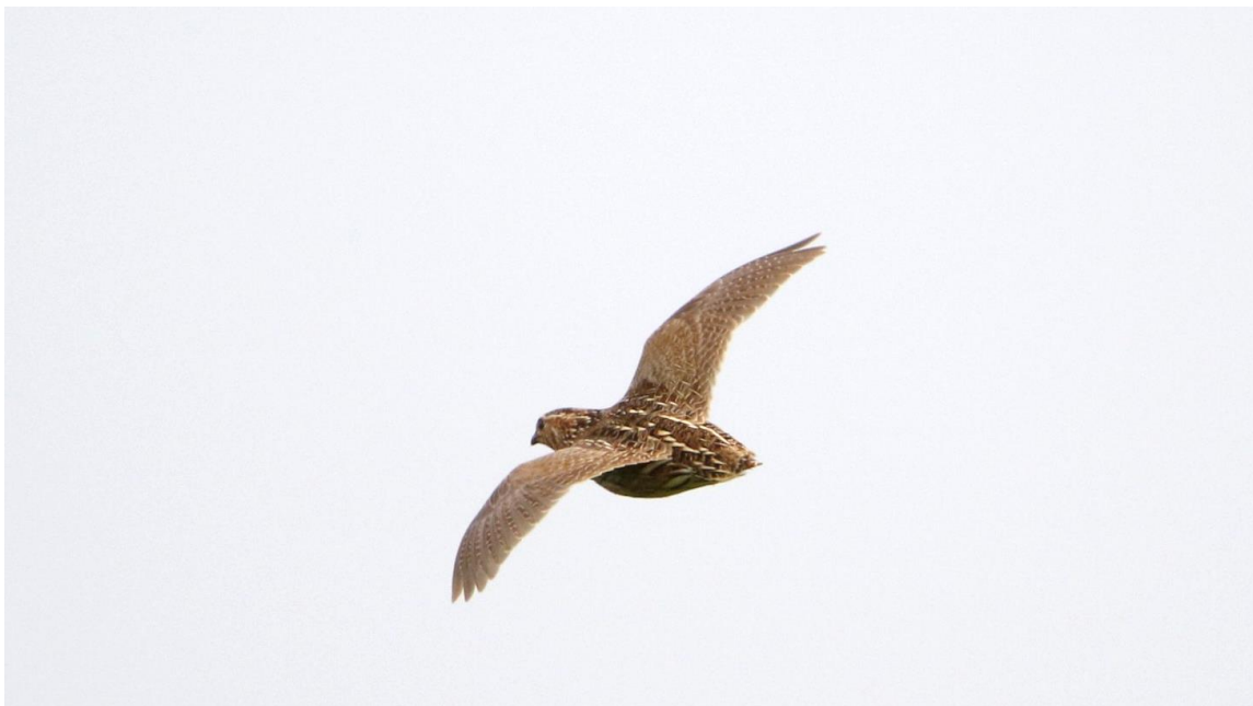
Common Quail [Adelle van Zyl]