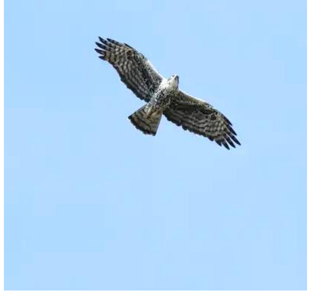
Ayres's Hawk-Eagle