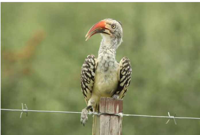
Southern Red-billed Hornbill

Charles Gilfillan came across this Hamerkop feeding in this unpromising puddle on the road and wondered what it found to eat there. To their surprise, he captured this image of it eating a tadpole which was in the very shallow puddle.