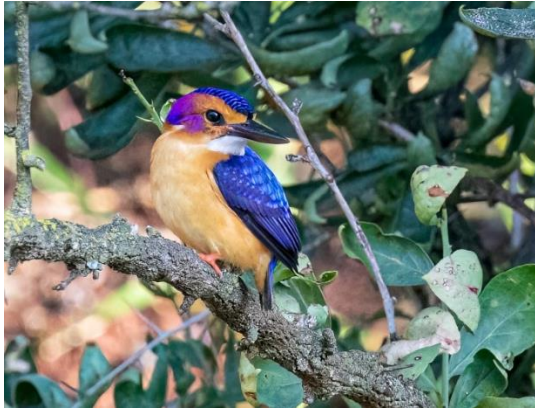
Pygmy Kingfisher

A warm thank-you to all our club's outing leaders who send in summaries of species seen and the Bird of the Day, as well as our eager photographers their photos. Without your contributions, BLING WiNGS would not be possible.