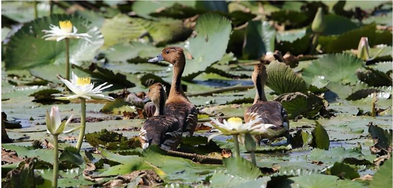
Fulvous Whistling Ducks [Adele van Zyl]