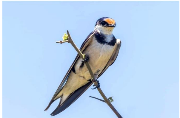
White-throated Swallow [Johan Botha]