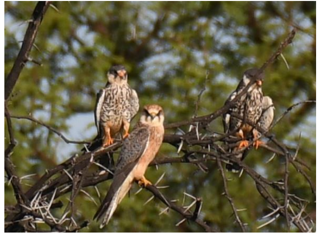
Red-footed Falcon, and Thrush Nightingale below.

Zaagkuildrift continued delivering rarities. Bronze-winged Courser, Collared Pratincole, Dusky Lark, Dwarf Bittern, Red-footed Falcon and Thrush Nightingale were reported by Pieter Verster and others.