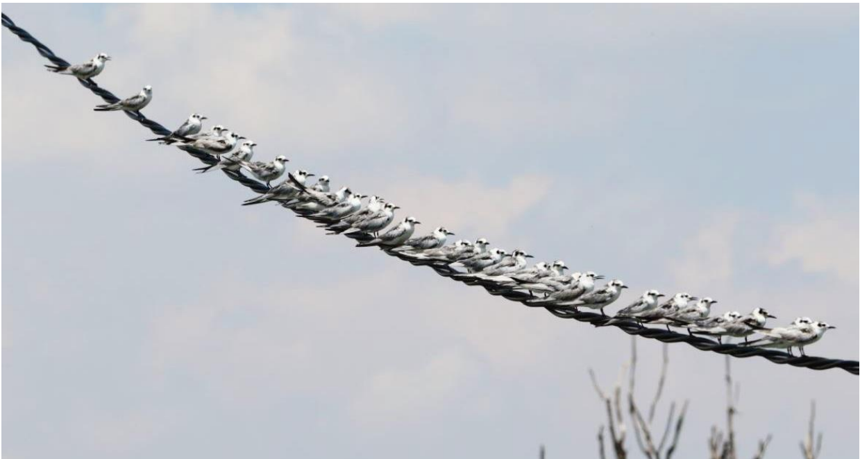
White-winged Tern roost [Adele van Zyl]