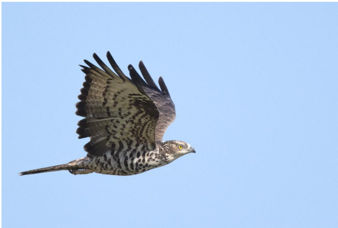
European Honey Buzzard – Wespedief