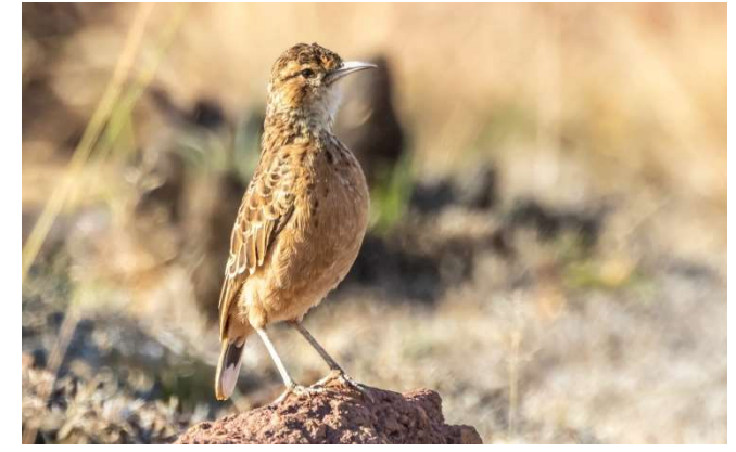
Spike-heeled Lark [Johan Botha]