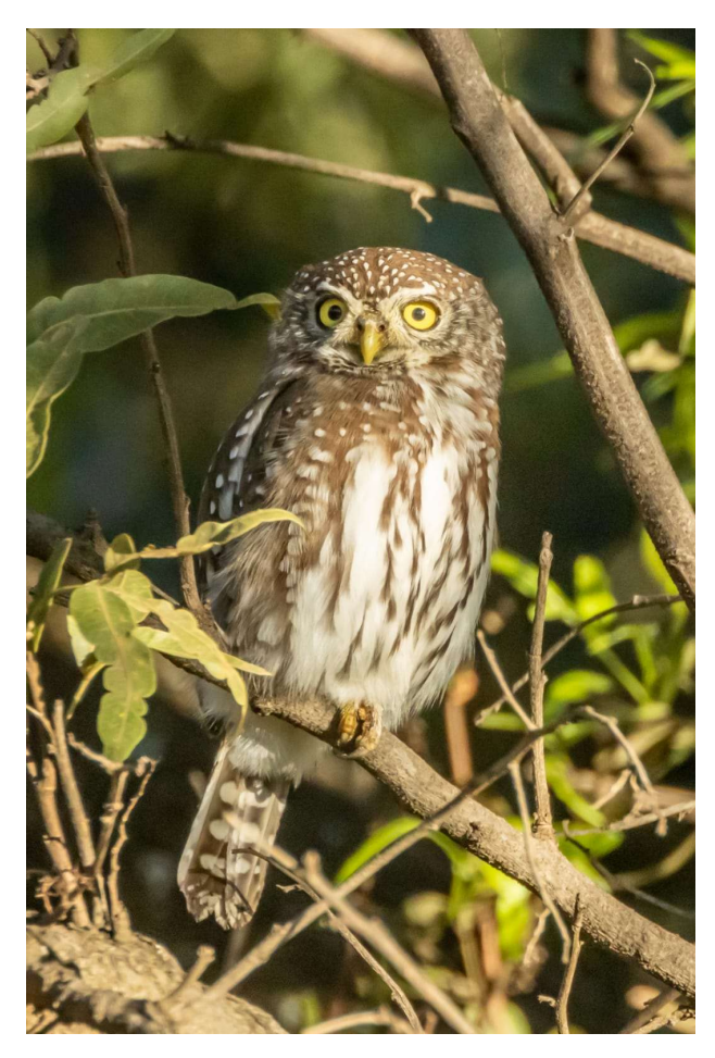
Pearl-spotted Owlet [Johan Botha]