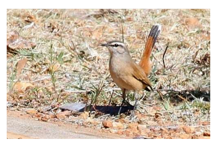
Bird of the Day – the cheeky Kalahari Scrub Robin