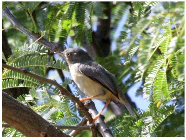
Burnt-necked Eremomela [Craig Green]