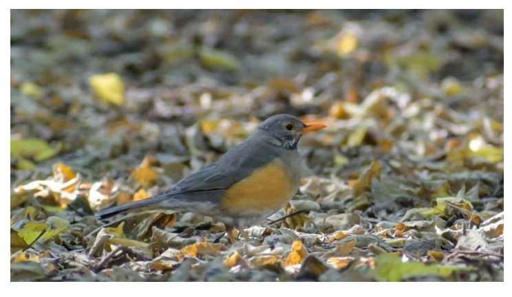
Kurrichane Thrush [Pieter Uitenweerde]

Brown-backed Honeybird [Pieter Uitenweerde]